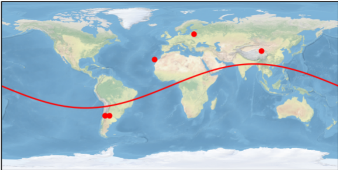
Figure 3: World map showing the locations of ground-based observatories participating in the time verification of TESS. The full red line indicates the trace of the ecliptic equator - observatories on the southern part will be the most useful for TESS time verification during the first year of operation, where the southern ecliptic hemisphere is being observed.

Simultaneous ground-based observations is a fundamental part of this project, and we have therefore set up a network of currently six telescopes in Argentina, Lithuania, Tenerife and China. These will be used to regularly perform simultaneous photometric observations of the same targets.